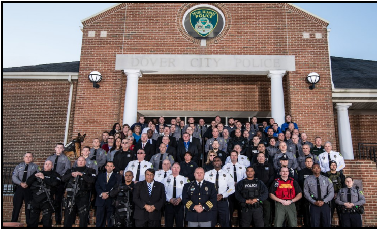
The Dover Police Department Special Units and civilians celebrating the DPD's 90th anniversary in 2015.

An officer's job doesn't end when their shift ends. Whether they are on or off duty, it is their job to