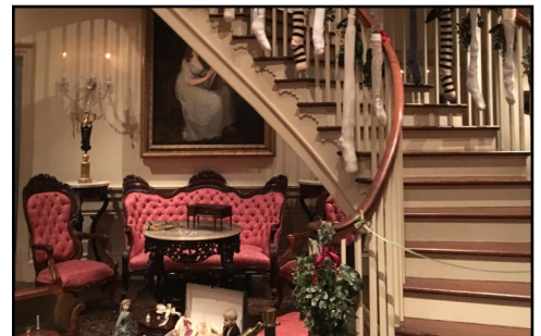
The DuPont house at Winterthur.

Upon arriving at the museum, students were split into groups with chaperones and a tour guide. During their tour they learned about various bugs. They learned about their habitats and purpose. After their tours they visited the decorated houses, tree house, and the gift shop before heading home again.