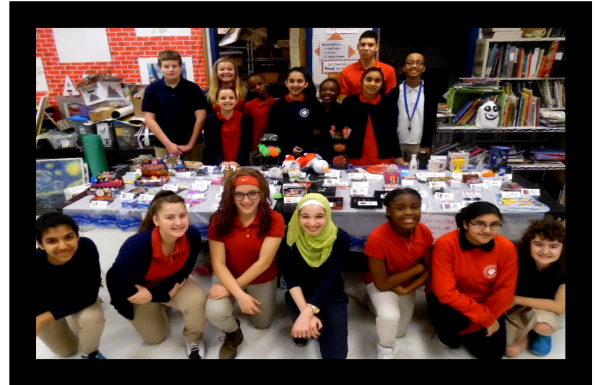
CROCS club at Little Shoppers.

Little Shoppers is a store where kid’s students buy their friends and family gifts for the holidays. Everything was priced so there was an item for every budget.