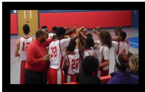
Pregame huddle for the Campus Cougars Boys basketball team.

The girls’ basketball team lost to Carvel but the boy’s team won over. Both girls and boys and boys played with Cougar Pride.